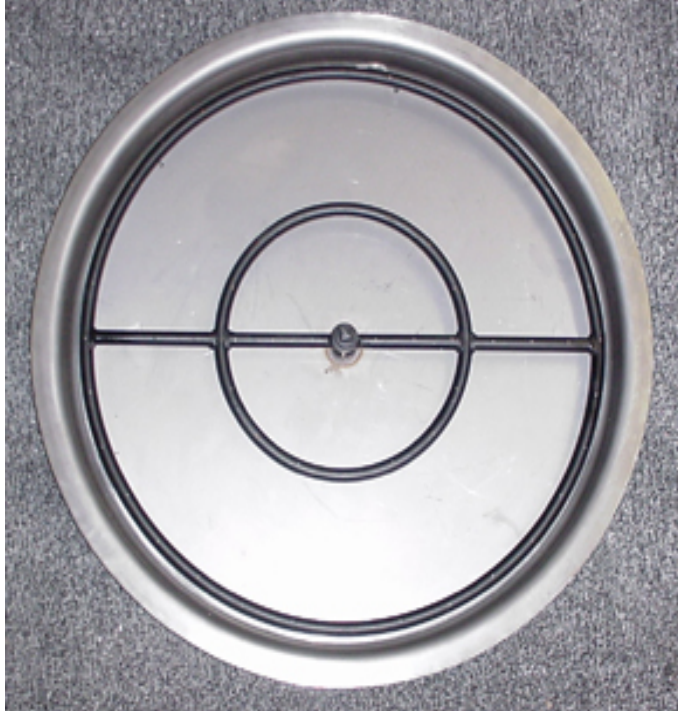
Fire Pit Pan and Burner: Pans available in Round (pictured), Rectangular, and Square.