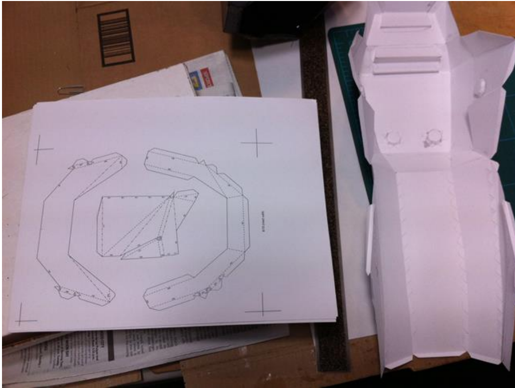
Paper pattern, cut out and glued together