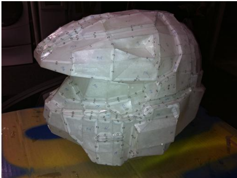
Resin and fiberglass