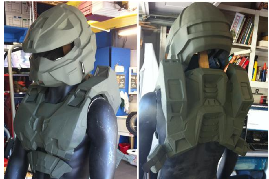
Bondo, sand, and paint