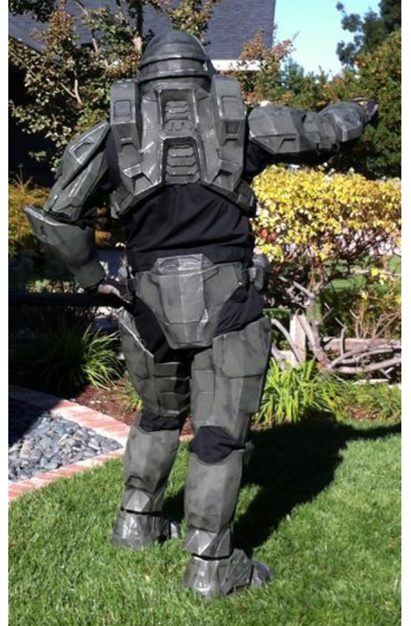
Painted and distressed