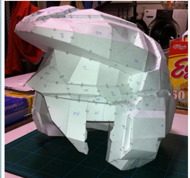
Cut out and glue pieces together