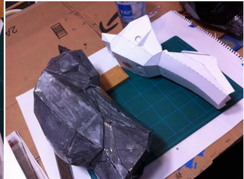
Fiberglass next to paper