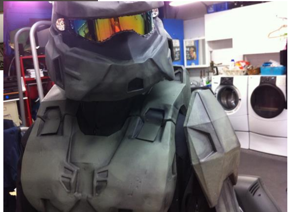
Fiberglass, bondo, sanded, and painted